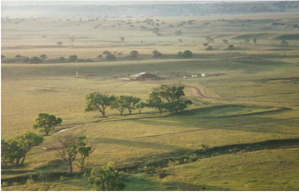
Hot Air Balloon view of Lazy J2 house and 432acs looking east