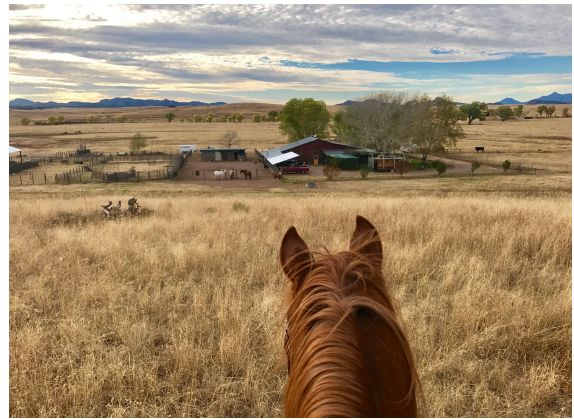
Dressed in the golden grass of Fall - house & corrals