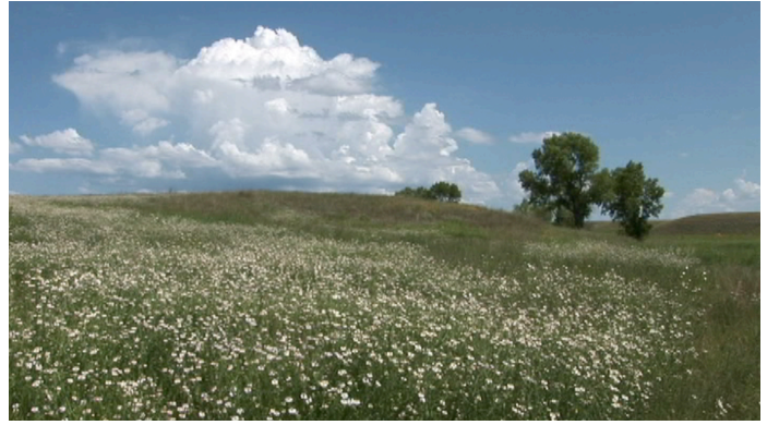
Summer time field of daisies in Home pasture