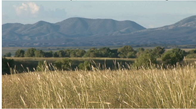
Grasslands overlooking cottonwood trees lining the Santa Cruz River