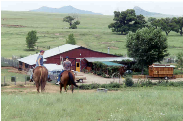
J2 South House & Ramada in the green of summer monsoons

Mature Trees - Lawn & Perennial Flowers - Timed Sprinkler & Drip Irrigation Systems 50x50 Fenced Vegetable Garden - Fruit Trees - 2 Water Wells and working Windmills