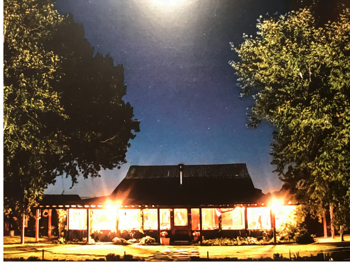
Lazy J2 South House under moonlight

17.8 Building Envelope currently contains a charming 1500 sq foot one bedroom house with all Electric Kitchen - Full Bath - Wrap around Screen Porch Fireplace - Air Conditioning - Heat Pump - Ramada - Shop & Storage - Enclosed Hay & Grain 16x20 Block Tack Room - Attached Full Bath - All Pipe Corrals - 60' Sand Round Pen Wi-Fi - Satellite TV - Multiple Phone Lines - Cell Service