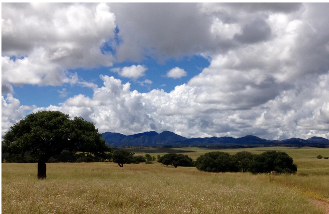
J2 South HOME PASTURE looking SW toward the Patagonia Mountains