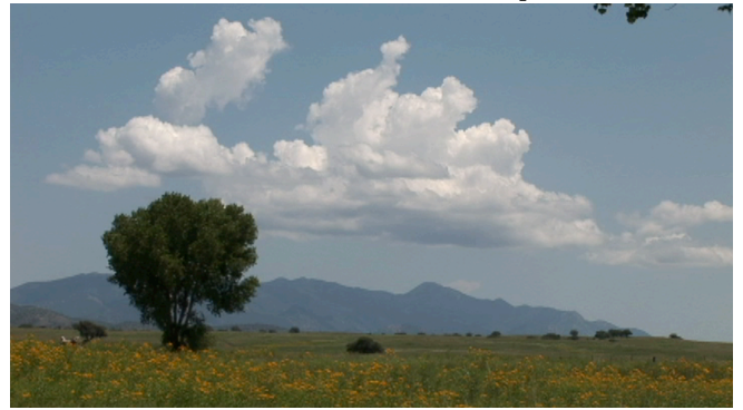
A Classic Summer Day with Montezuma Pass in the distance