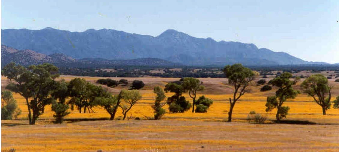
September field of Golden Eye in the FARM - all part of Lazy J2 Ranch Estate South

The large building envelope allows for additional structures or new construction. The property is contiguous to hundreds of thousands of acres of the Coronado National Forest known for its multiple use opportunities. Mountain biking, horse back riding, hiking, wildlife photography, camping are available year round. At 4900 feet the climate is temperate and ranges from 50 to 90 degree daytime temperatures. The majority of rainfall comes between July and September with the occasional winter storm and every once in a while snowfall of 3-4 inches that last a few days.