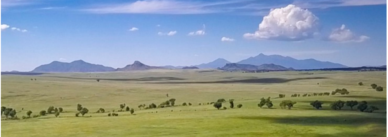
Red Mountain - Saddle Mountain and Mount Wrightson on the horizon of J2 Ranch Estate North