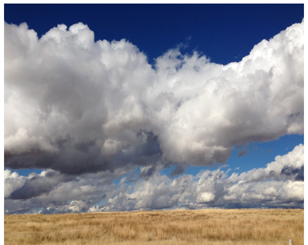
Stunning Winter gold and blue