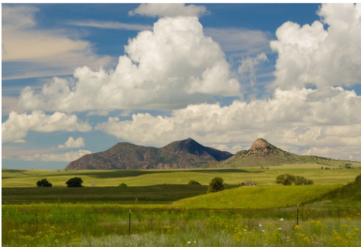
Monsoon green and the valley looks like Ireland