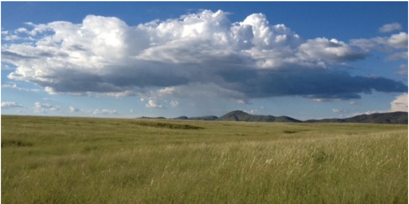
Lazy J2 North is 520 acres of sweeping vistas and a 360 degree pristine panorama of stunning grassland.