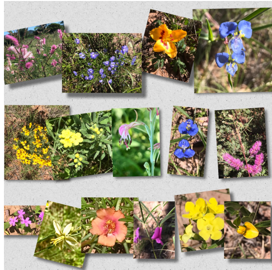
Seasonal rain brings out the wildflowers