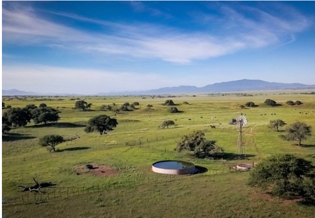
Vista from the building envelope looking south