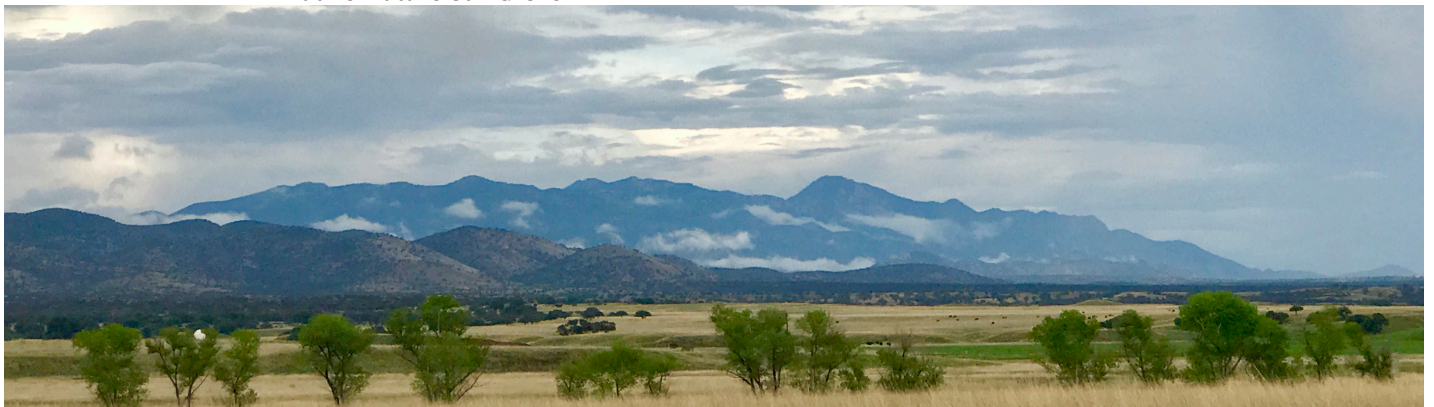
Looking east from Lazy J2 Ranch Estate North - 9000 ft Huachuca Mountains & Canelo Hills

Stunning views of the rolling grasslands spread out on your doorstep and the magnificent vistas of the San Rafael Valley surround you. Building envelope is contiguous to USFS Coronado National Forest.