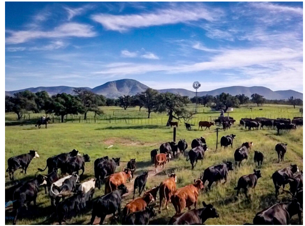
Cattle drive headed north toward the oak strewn building site