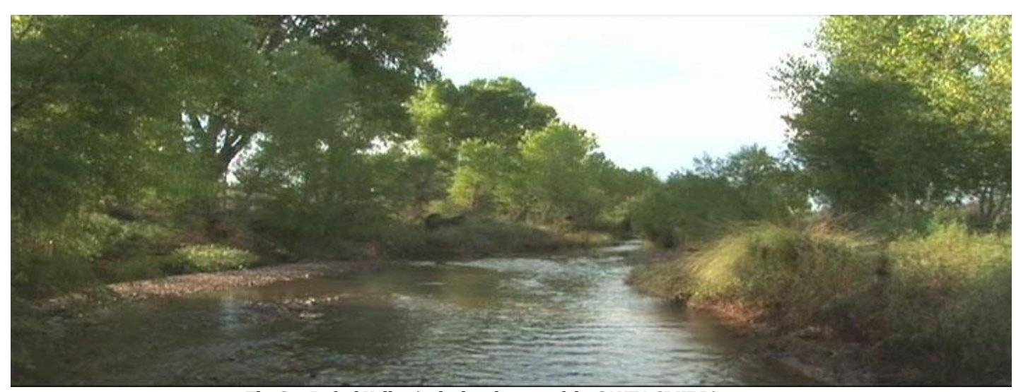
The San Rafael Valley is the headwater of the SANTA CRUZ River