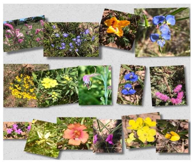
Seasonal rain brings out the wildflowers