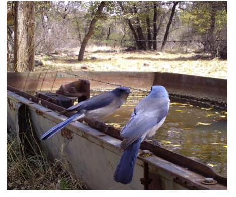
There are 17 threatened and endangered species in the San Rafael in balance with man & nature