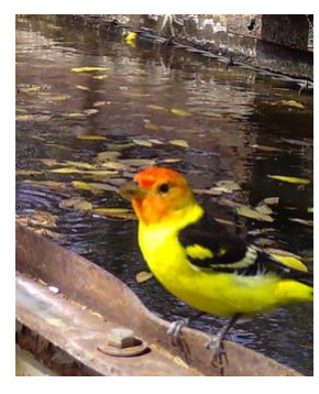
The Audubon Society has named the San Rafael Valley as a prime bird watching location